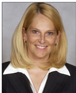
BRENDA FRESE Head Coach Arizona '93 16th year at Maryland 19th year overall